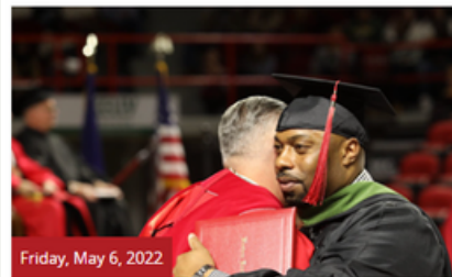
Friday, May 6, 2022