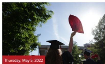
Thursday, May 5, 2022